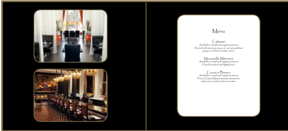
Option A (Two 5x7 inch images and menu)